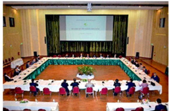
AITAA President at the AIT Board Meeting, 16 February 2017, AIT Conference Center