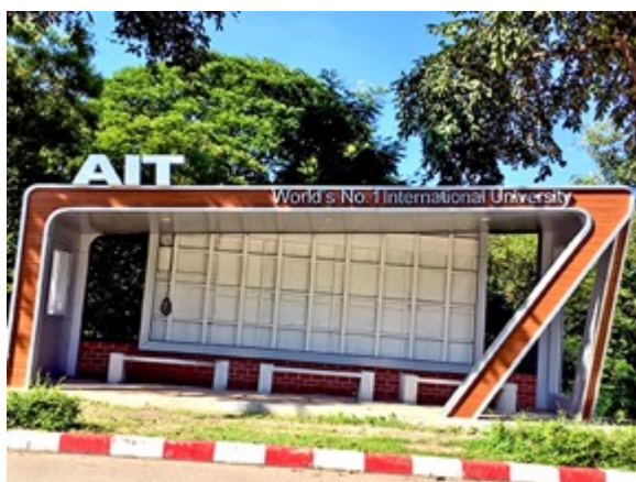
The Bus Station