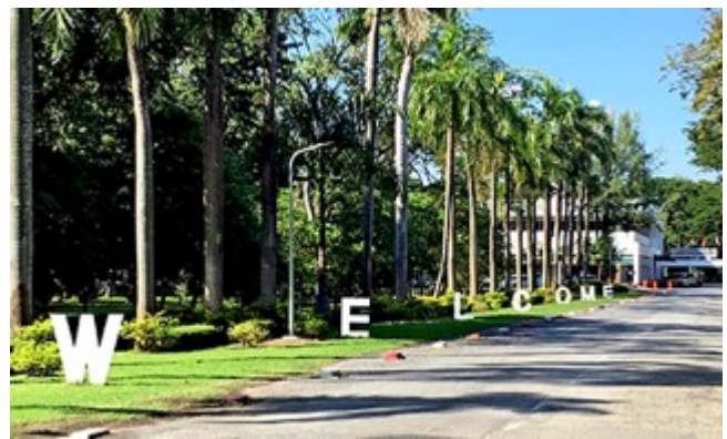
The Welcome sights and signs