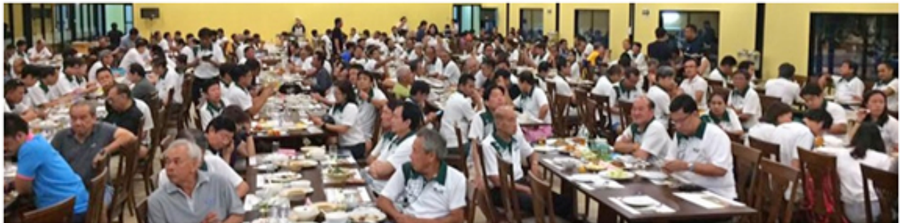
Golf Tournament Dinner Party attended by AIT alumni and Friends of AIT