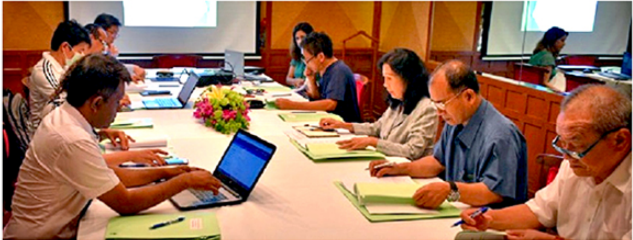
AITAA Executive Committee Meeting, August 2017, Bangkok

AITAA ExCom held a total of ten (10) meetings to date. Sub-committee meetings were also held on several occasions.