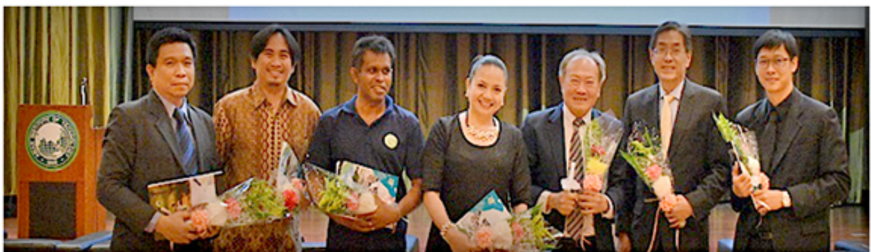
Members of the AITAA Executive Committee at the 126 th Graduation Night and AITAA Induction Ceremony, August 2016, AIT

Postal Address: P.O. Box 4, Klong Luang Pathumthani 12120 Thailand