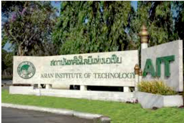
The entrance road sign before

The campus is dotted with new and refurbished landmarks such as the entrance signage, arc, globe, tower clock, bus station and many more! Thanks to AIT alumni and benefactors for their benevolent contributions in making these landmarks possible.