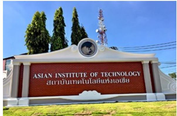
The entrance road sign now