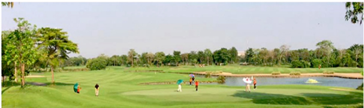
Venue of the AITAA Golf Tournament at Cascata Golf Club, 17 March 2017, Bangkok

Postal Address: P.O. Box 4, Klong Luang Pathumthani 12120 Thailand