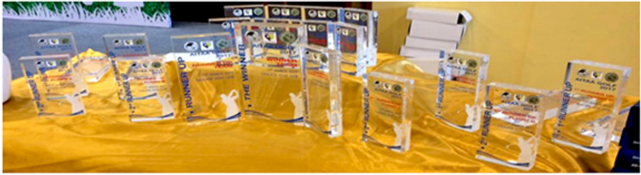
AITAA Golf Tournament Trophies