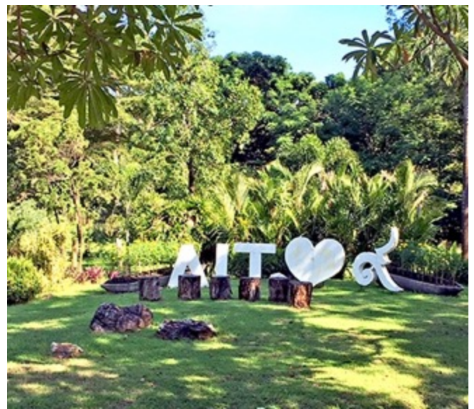
The campus' beautiful landscape