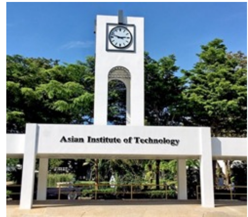
The Tower Clock