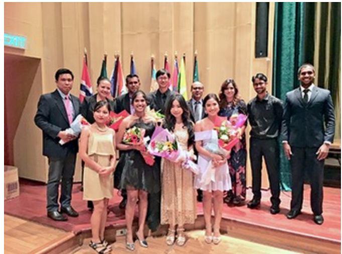
Members of the AITAA Executive Committee together with AIT Student Union Officers and Graduates at the 127 th Graduation Night and AITAA Induction Ceremony, 12 May 2017, AIT Conference Center