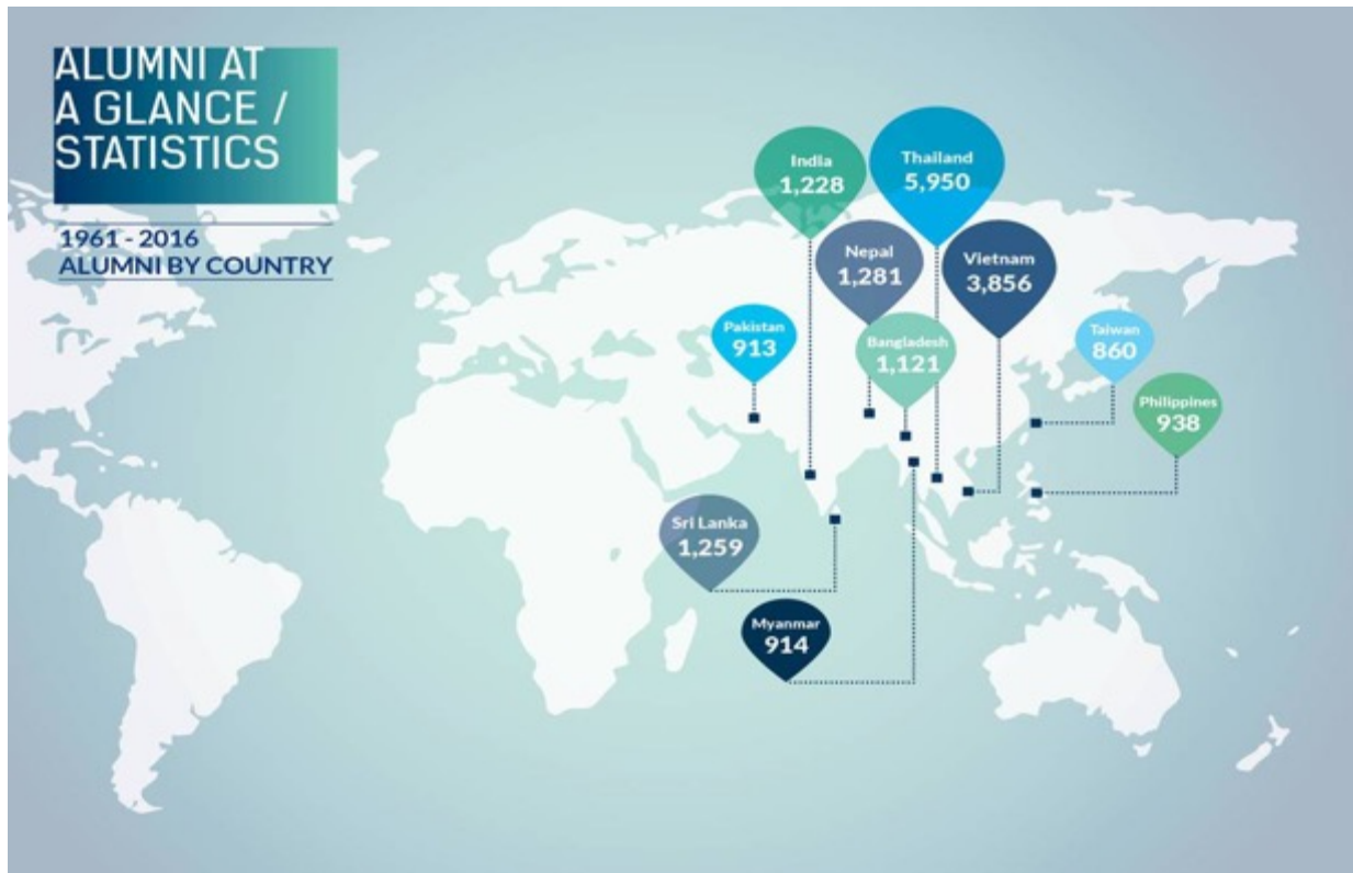
Alumni distribution of the Asian Institute of Technology (AIT)